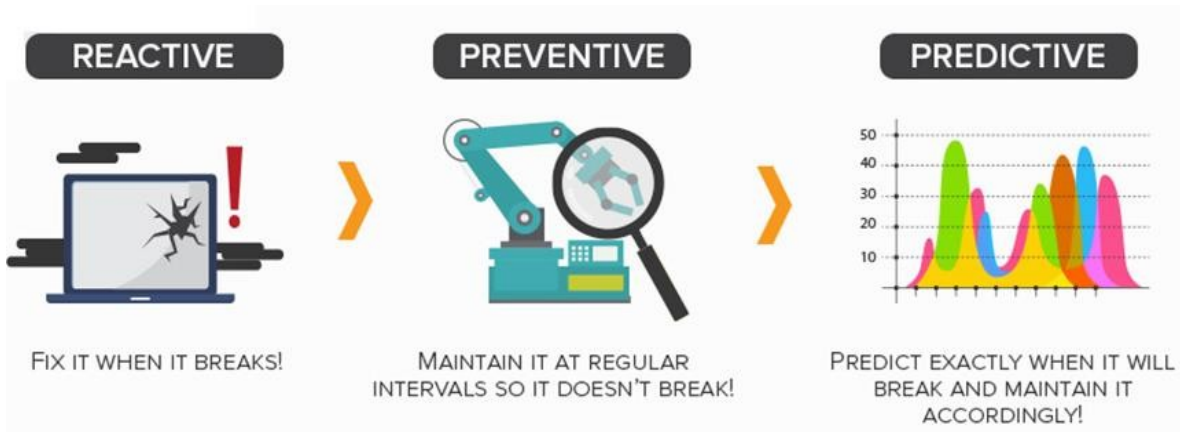
Figure 1. Reactive, preventive and predictive maintenance comparison.

This whitepaper aims at demonstrating a practical application example of the usage of Predictive Maintenance and Artificial Intelligence techniques to the Industry 4.0, which is the Damage prediction and diagnostics on Roller Bearings based machineries .